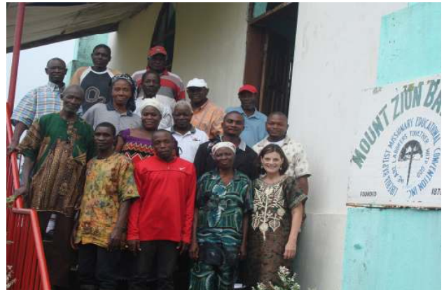
Members of the church