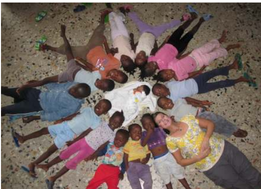
Circle of Love