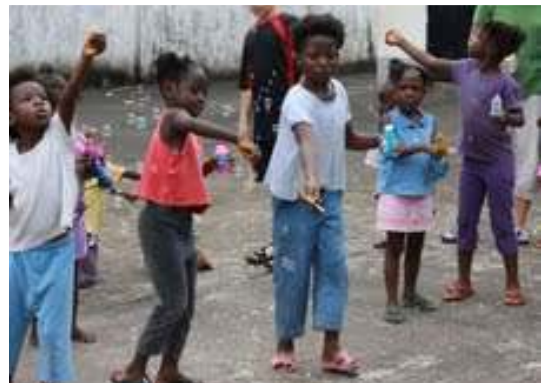
Fun with bubbles!