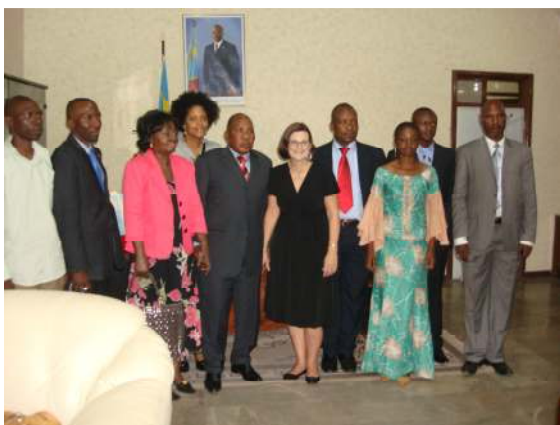
AOH Staff with the Minister of Health and Social Welfare