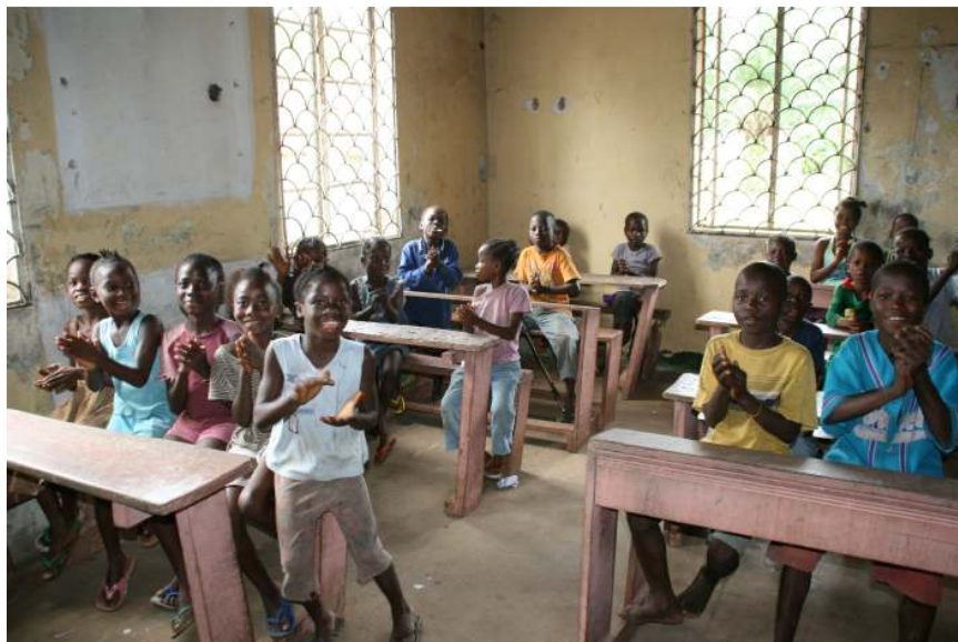
Students look forward to their new school complete with uniforms

AOH has supported the Wilbel Foundation School which has been a make shift school in an abandoned building in the community. The building is in need of extensive repair. AOH has sponsored numerous students and help to supplement the teacher's salary to this school. With the involvement in the community to bring HOPE to the residents there Acres of Hope stepped out in Faith and committed to bring quality education to the children. This last year AOH in partnership with our sister organization AOH-Belgium has raised $60,000 for the construction of the new Acres of Hope Rock Hill Elementary/Training Institute which will open her doors in September 2010. We HOPE to educate a minimum of 500 students per year with the addition of adult education training classes in the late afternoon and evenings. A teacher sponsorship program has been established to offset tuition fees for students. The adult education program will include literacy and skills training such as sewing, soap making, and classes on independent business success. If you would like to be a part of this exciting program to give HOPE to hundreds of kids, please visit www.acresofhope.org or email us aoh.savinglives@gmail.com