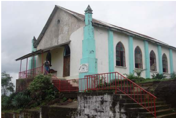
The MT. Zion Baptist Church

HOPE comes in many forms, Orphan Rescue, Education, and Medical Outreach, but none so important than meeting the Spiritual needs of a nation hurt by years of war and dysfunction. Acres of Hope recognizes that without the Spiritual foundation and commitment to serve the Lord, none of what we do has much meaning. Recently I was appointed to develop a ministry in Robertsport which is about 2 hours from the Capital in Cape Mount County. This community is about 70% Muslim, but back in 1834 the Mt. Zion Baptist Church was founded in Robertsport. Today this church building sits on 10 acres overlooking the Atlantic Ocean. With only 15 members in the congregation, but a heart to grow, I have made a personal commitment to develop and support this vital ministry. Our Christian presence is a testimony in the community. Plans are in progress to restore the historical church building, build an elementary school and construct 2 missionary houses on the property. Total project cost is $250,000