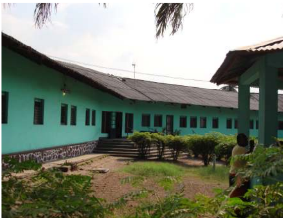
AOH Orphanage Children's Home

I was particularly touched to visit mission stations where my parents served as medical missionaries when I was a child. Things had CHANGED in 40 years, but our house was still there and it was great to walk the halls of my father's hospital. It brought back many wonderful memories of my childhood and also reminded me of how much work there is still to do. Another blessing came our way when the very dorm I grew up in at boarding school, became the new AOH Orphanage Children's Home! Talk about coming full circle!