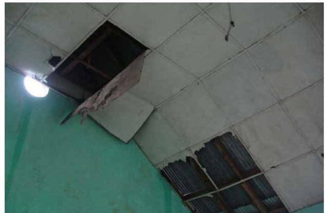
Repairs are needed

Consider becoming a partner in this important ministry. Or perhaps your church would like to “adopt” the Mt. Zion Community Church. Your involvement will not only bless this ministry, but will be a testimony to an entire community that needs desperately to hear of HOPE through Jesus Christ. Mt. Zion is committed to Romans which states: