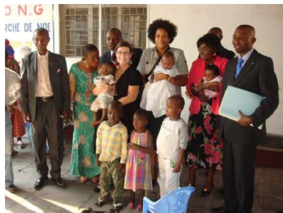
AOH Staff with the first group of children adopted from Congo