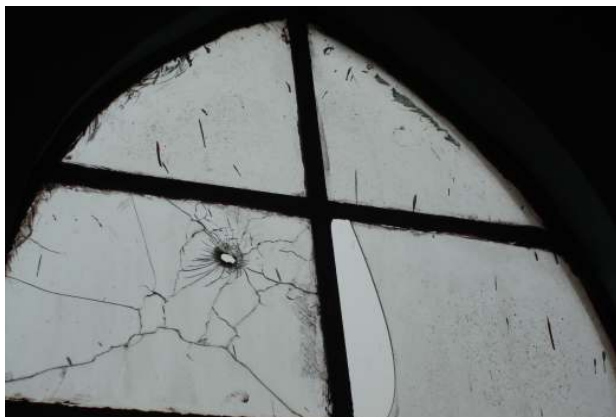
Bullet hole from the war